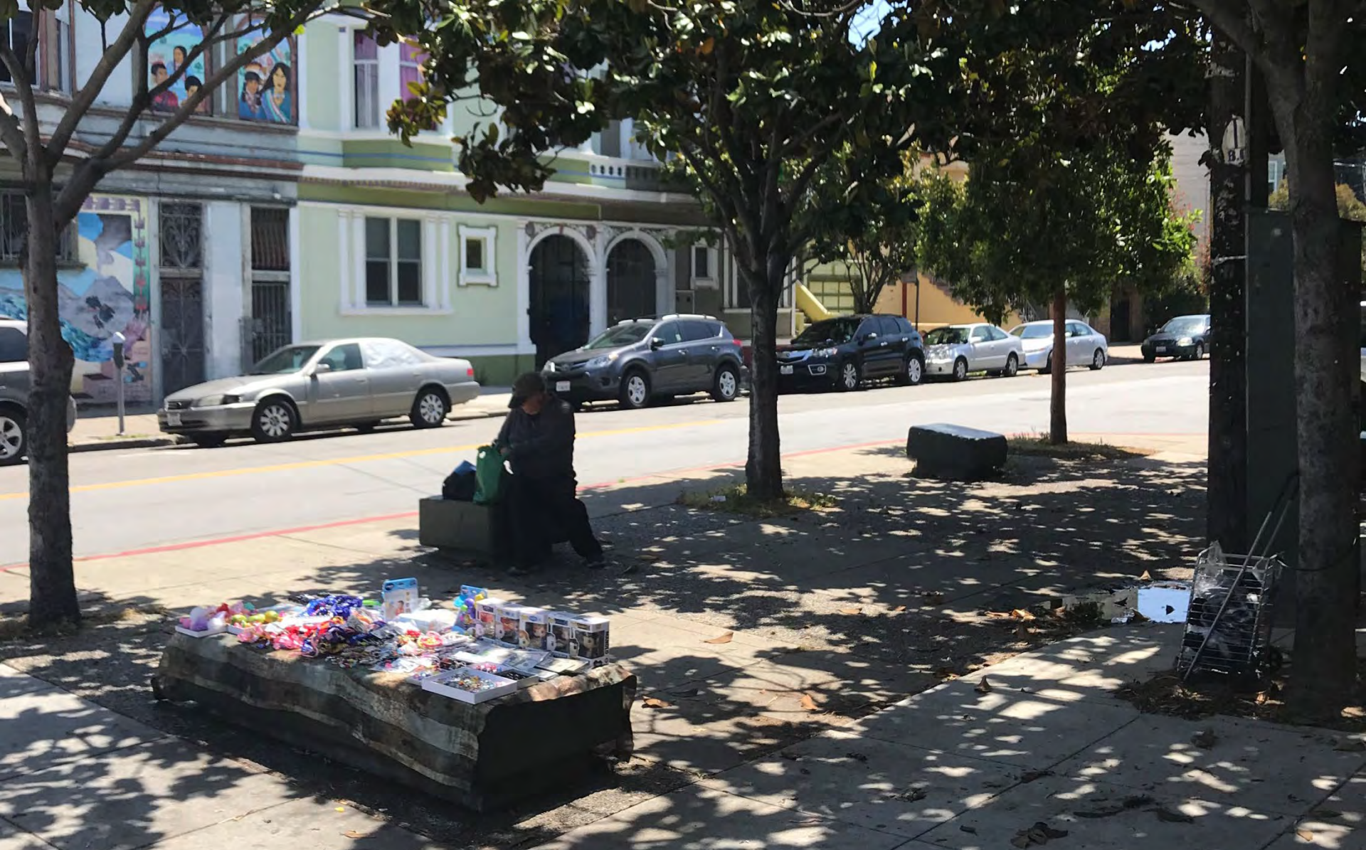
“Small plazas (placitas) in large bulb out areas”