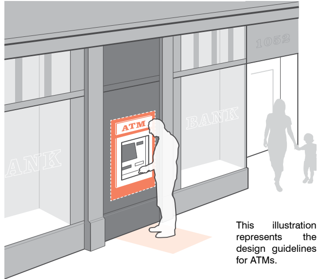
This illustration represents the design guidelines for ATMs.

A single ATM at a street façade may be permitted without conditional use authorization if the machine meets the Performance-Based Design Guidelines in this document. A single automated teller machine may not be permitted at the street front if it compromises the storefront's ability to meet other Performance-Based Design Guidelines, including visibility and transparency goals.