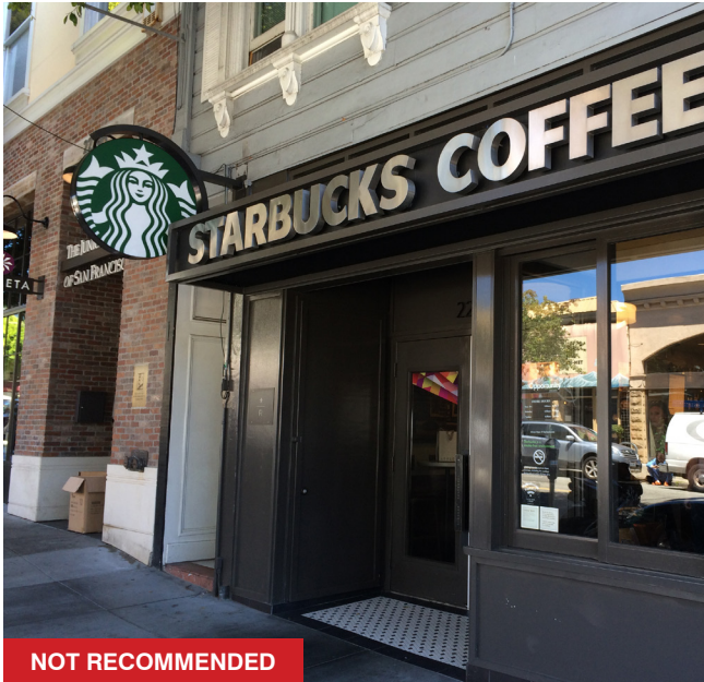
Design, including colors, finish, and texture, is inconsistent with the surrounding buildings.