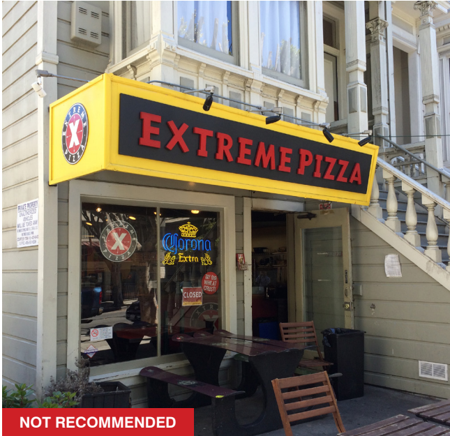
Scale of sign is inappropriate and extends beyond the storefront entrance.