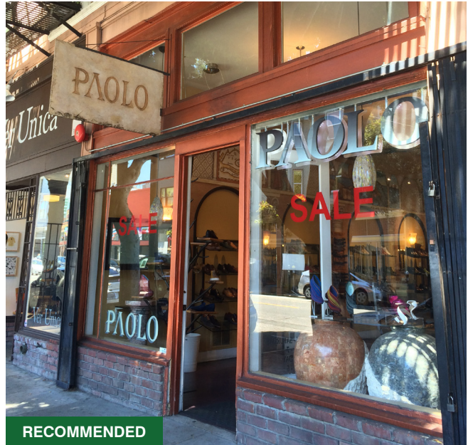
Storefront design is consistent with surrounding buildings, and the setback creates a continuous street wall and edge.