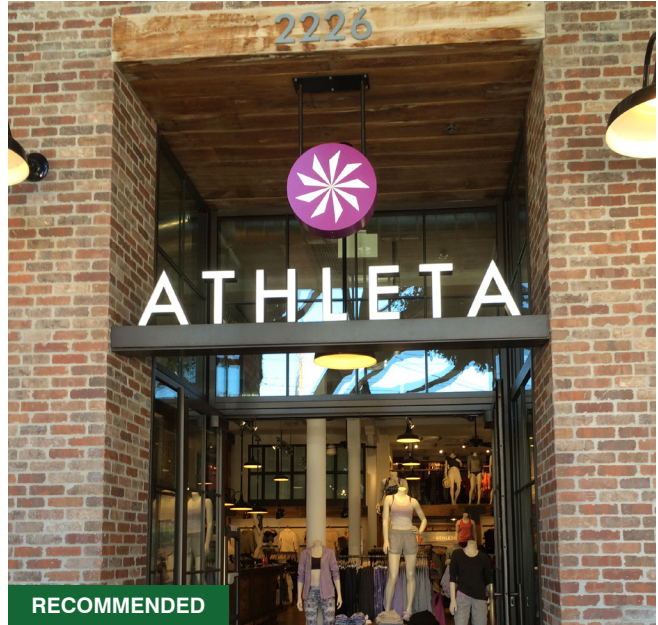
Sign does not extend out and beyond the width of the storefront opening.