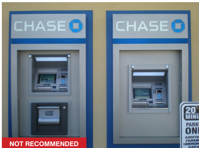
This requires a conditional use permit because there is more than one ATM at the street front.