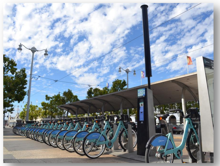
The Bay Area's bike share will be the largest bike share per-capita in the country when expansion is complete