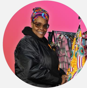
ECONOMIC + WORKFORCE DEVELOPMENT