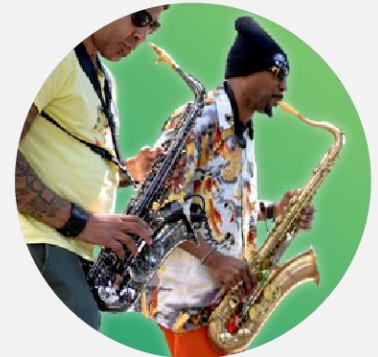
PLACEMAKING, ARTS + CULTURE