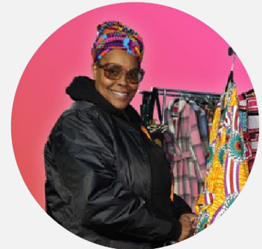
ECONOMIC + WORKFORCE DEVELOPMENT