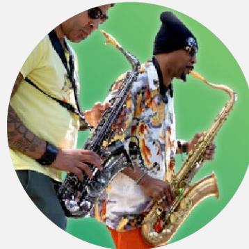
PLACEMAKING + CULTURE