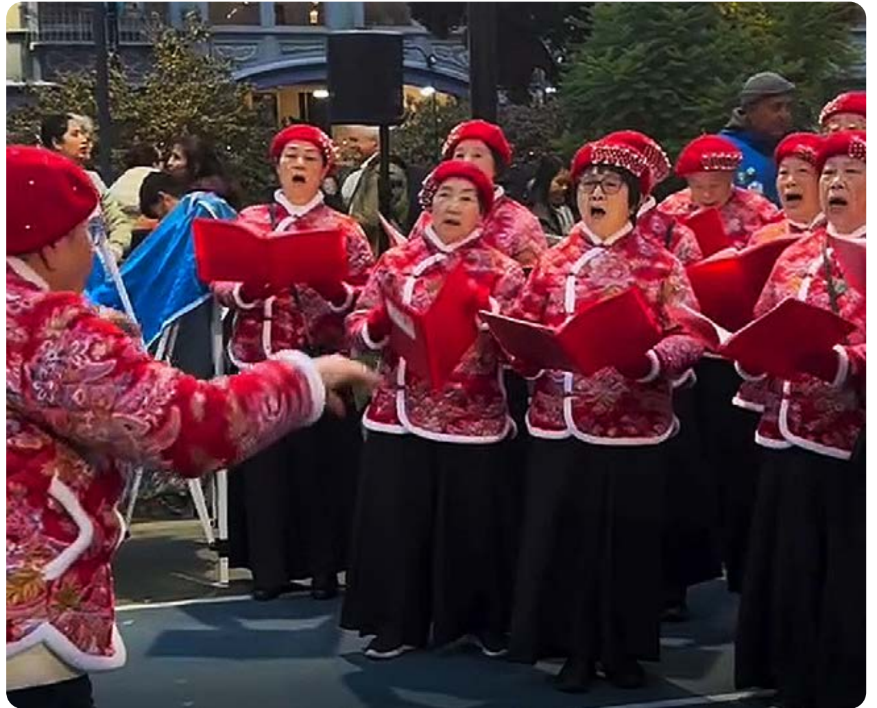
Tenderloin Holiday Tree Lighting Ceremony

On Friday, December 13th Community members gathered to participate in the second Tenderloin Tree Lighting Ceremony at Boeddeker Park, funded by TCAP. The event included a program highlighting speakers from the community and legislative stakeholders. It also included a diverse array of performances from Skywatchers and the Tenderloin Chinese group, showcasing the rich diversity of culture in the Tenderloin.