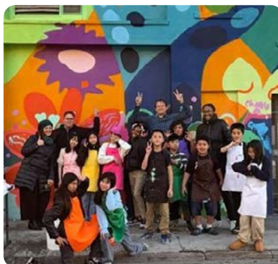
Elm Alley Mural Arts Club at TLCommunity School

Making this alley a beautiful place to be will encourage new programs and youth groups to use it, gaining much-needed open space for the neighborhood. The project is currently under installation with completion projected for the end of February 2025. A community celebration with interactive art making will soon follow.