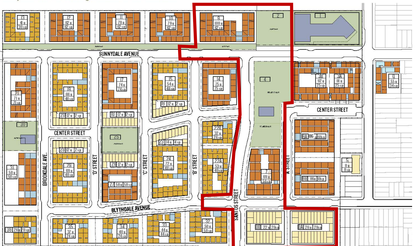
Sunnydale Phase 4 – at Completion