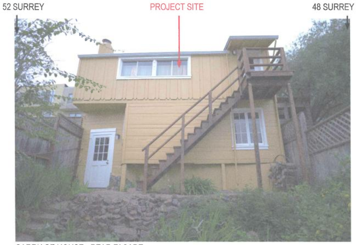
CARRIAGE HOUSE - REAR FACADE