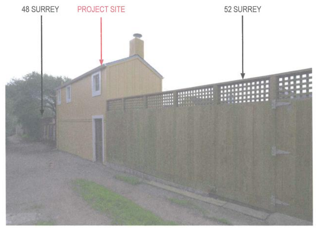
CARRIAGE HOUSE - FRONT FACADE (PENNY LANE)