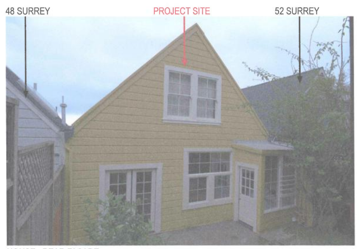
HOUSE - REAR FACADE