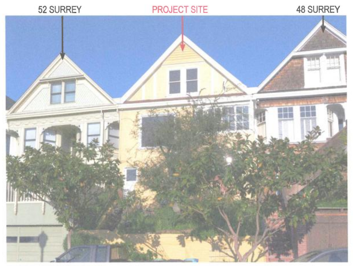
HOUSE - FRONT FACADE